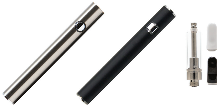
HD18 Battery HD3 Battery HD4 Cartridge