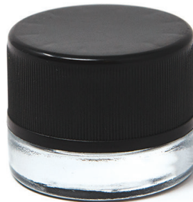
Child Resistant Cap

These crystal-clear glass concentrate containers come paired with either a standard lid or a push-and-turn child resistant lid, allowing you to package your extracts in the most desirable fashion. Combine your purchase of our child resistant option with an opaque child-resistant bag to ensure you're staying compliant with Health Canada.